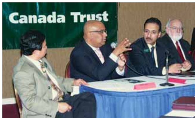
Together with the Sri Lankan Business Council, TD Canada Trust hosted the Path to Success seminar, reflecting our commitment to both diversity and small business.

Our commitment starts with diverse and innovative financing products and programs, sometimes offered in collaboration