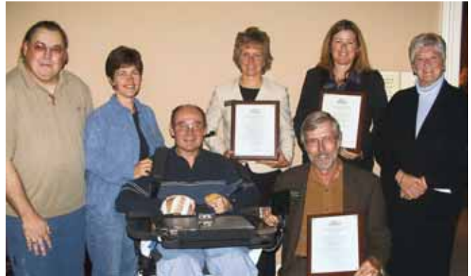
TD was recognized in Orangeville, Ontario, with the "Promoting a Barrier-Free Community Award." Pictured are local branch managers (with awards) and members of the town's Accessibility Committee.

Whether through our 1,036 branches, 2,503 ABMs, telephone banking or Web banking, each year we continue to provide increased accessibility to TD services.