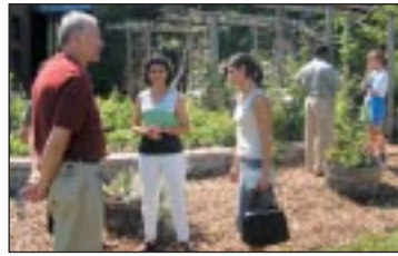
Left: Two environmentally conscious employees take time away from their jobs to clear waste from a local riverbank. Centre: Employee volunteers in Vancouver, B.C. showcase their “catch” during the Great Canadian Shoreline Cleanup. Right: In support of environmental preservation, the Eglinton Park Heritage Community Garden in Toronto was funded by FEF.