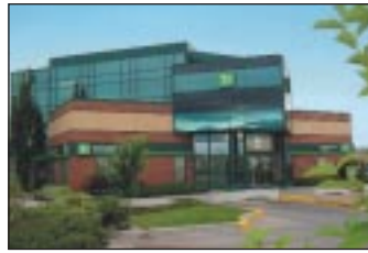
Left: TDBFG continually upgrades its head office and branch premises with environmentally efficient lighting systems and energy conservation initiatives. Right: TD Canada Trust locations, including Calgary's Crowfoot Branch, utilize pesticide-free landscaping and lawn maintenance, including water-based or eco-friendly supplies.