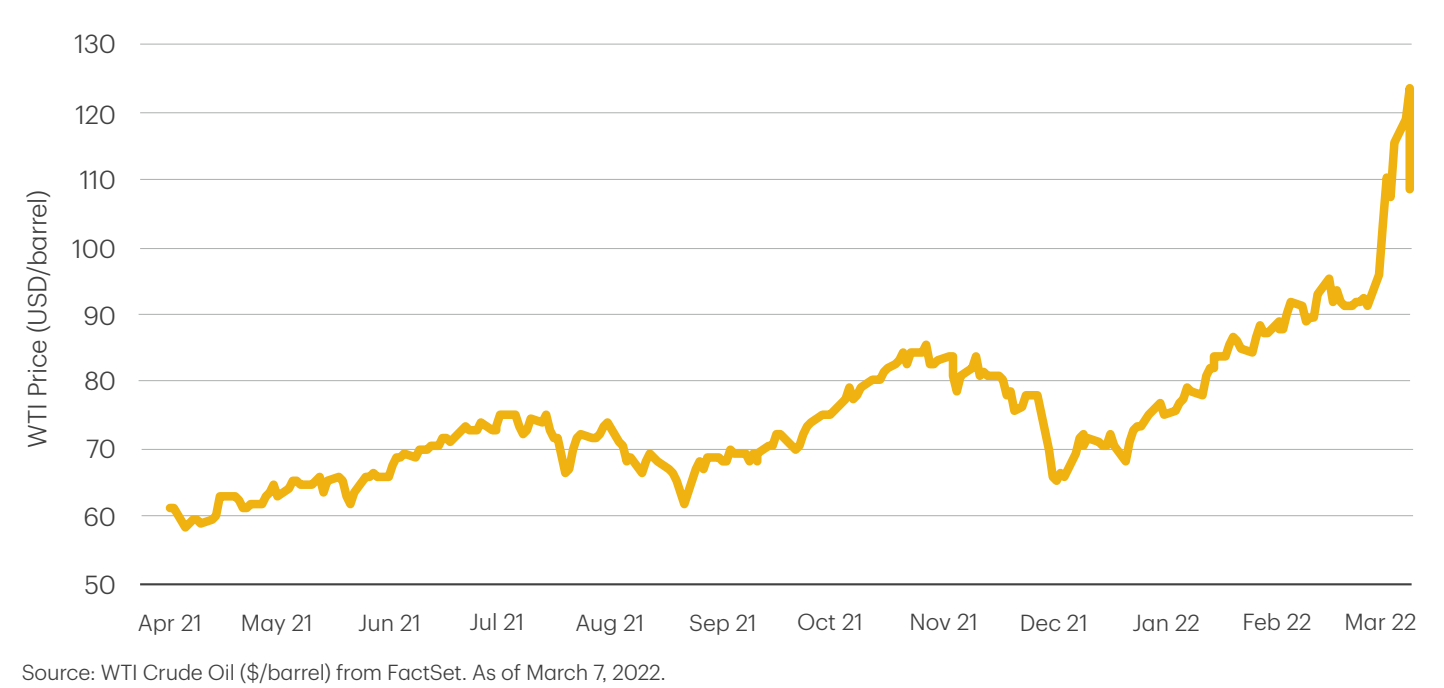
Chart 2: Oil Continues its Steady Climb

With the recent Russian invasion of Ukraine, oil prices have shot up over $100/barrel and, as a result, consumers have been feeling the pain in their wallets as gasoline prices hit record levels across the globe. Chart 2 below highlights the steady grind higher, with West Texas Intermediate (WTI) oil prices averaging approximately $66/barrel in the second quarter of 2021, $70/barrel in the third quarter, $77/barrel in the fourth quarter and nearly $90/barrel so far in 2022.